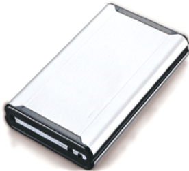
HDS-01 Without HDD