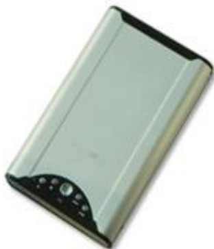
HDS-03 Without HDD