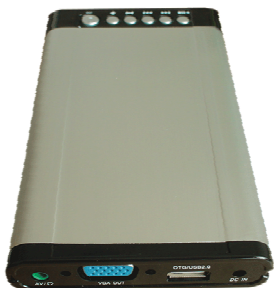
HDS-05 Without HDD