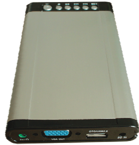
BSHD-102 without Hard Disk